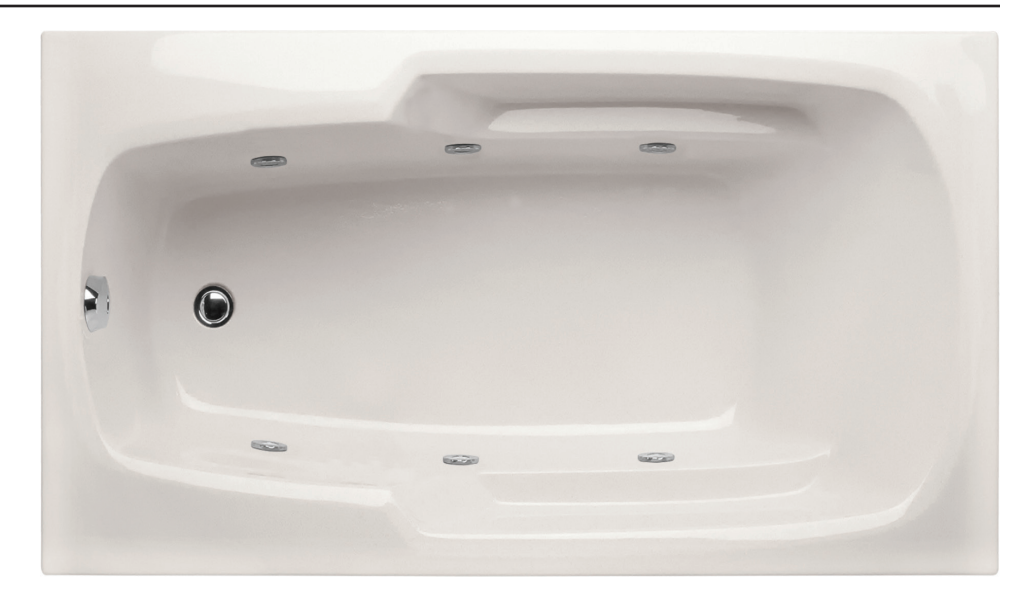
*Tub must be set in mortar base*