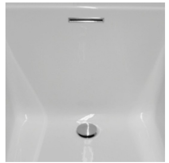
Linear Integral Waste and Overflow